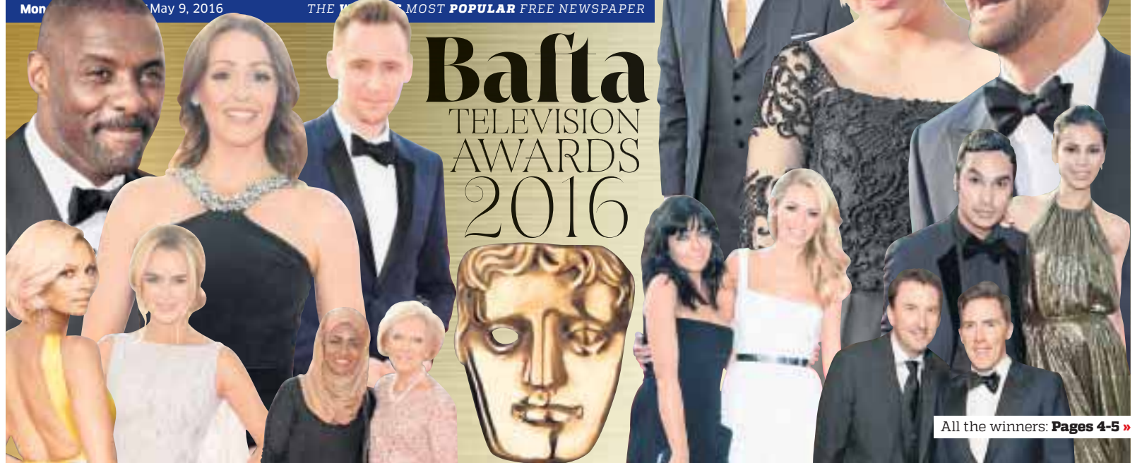
All the winners: Pages 4-5 »

■ Tories accused of using Donald Trump tactics Page 7 » ■ The £570-a-month cost of fighting cancer Page 12 »