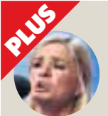
PLUS ANGER AT BGT GIRL WHO'S BEEN IN CORRIE Page 3 »