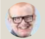
IS CHRIS EVANS A BULLY AT WORK? Page 13 »

World warning: David Cameron will say that peace could be at risk if Britain leaves the EU